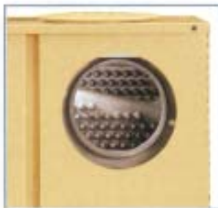
As shipped (rear flue)

The WTGO has two flue outlets — one in back, one on top — to provide complete venting flexibility. The boiler is shipped ready for back venting with an aluminized steel cap on the top flue outlet. If top venting is desired, the flue cap can be quickly removed and attached to the back outlet. Two special L-brackets are supplied to make it easy to connect flue pipe to either outlet.