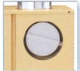
Converted (top flue)

The WTGO has two flue outlets — one in back, one on top — to provide complete venting flexibility. The boiler is shipped ready for back venting with an aluminized steel cap on the top flue outlet. If top venting is desired, the flue cap can be quickly removed and attached to the back outlet. Two special L-brackets are supplied to make it easy to connect flue pipe to either outlet.